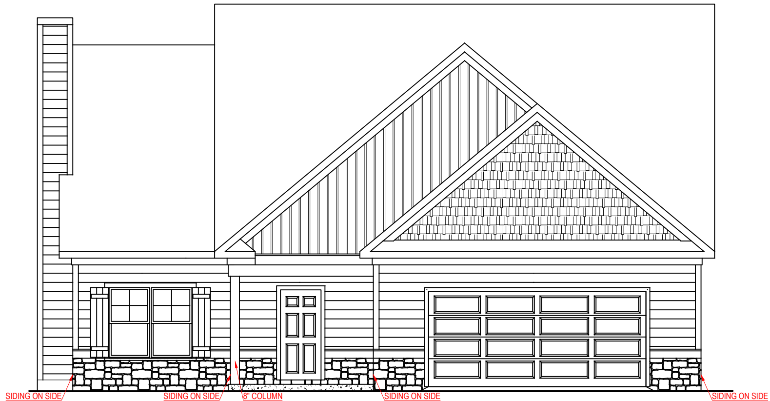
FRONT ELEVATION - B VERSION