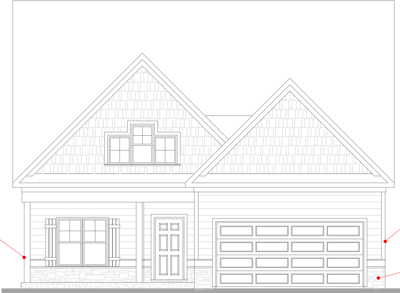
FRONT ELEVATION- B VERSION