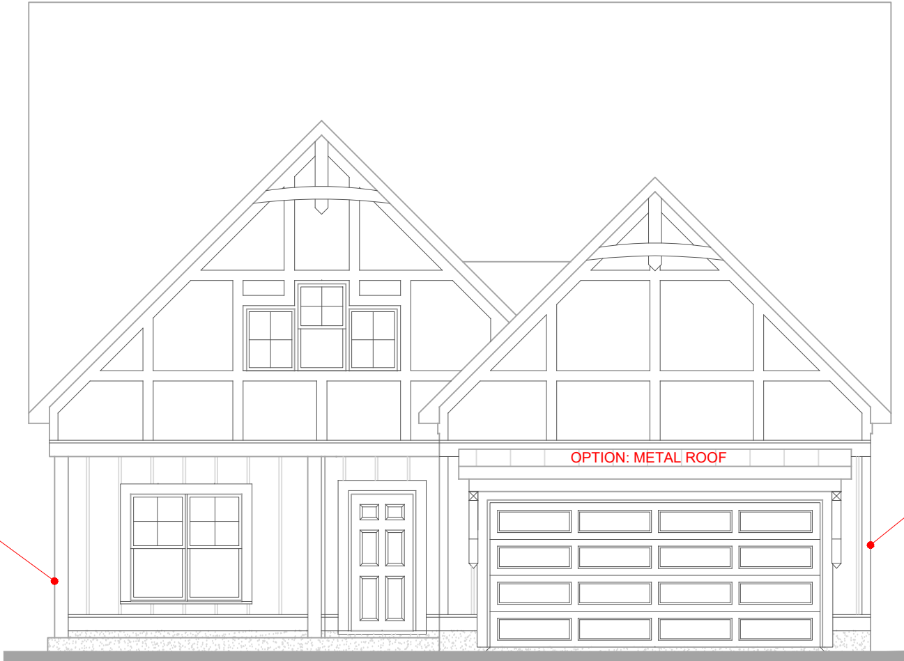
FRONT ELEVATION- A VERSION